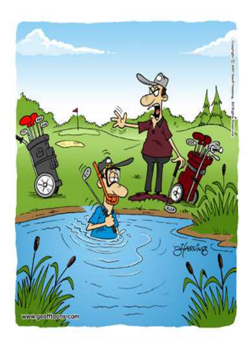
"WHY CAN'T YOU JUST TAKE A PENALTY SHOT LIKE EVERYONE ELSE?!"

Our members are our greatest ambassadors! Thanks for all you do!